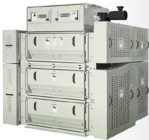
ROSKAMP RM/HX 1200/1600 ROLLER MILLS