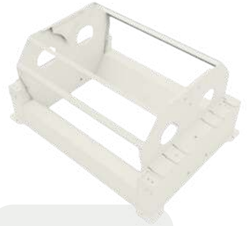
Roll housing base

The three-piece roll housing design allows access to the rolls from both the front and rear of the flaking mill. The Clean-in-Place system, complete with steel cheek plates, allows for cleaning during operation. Inspection doors, product sample, and roll temperature ports are provided for operators to monitor flake thickness and roll performance.